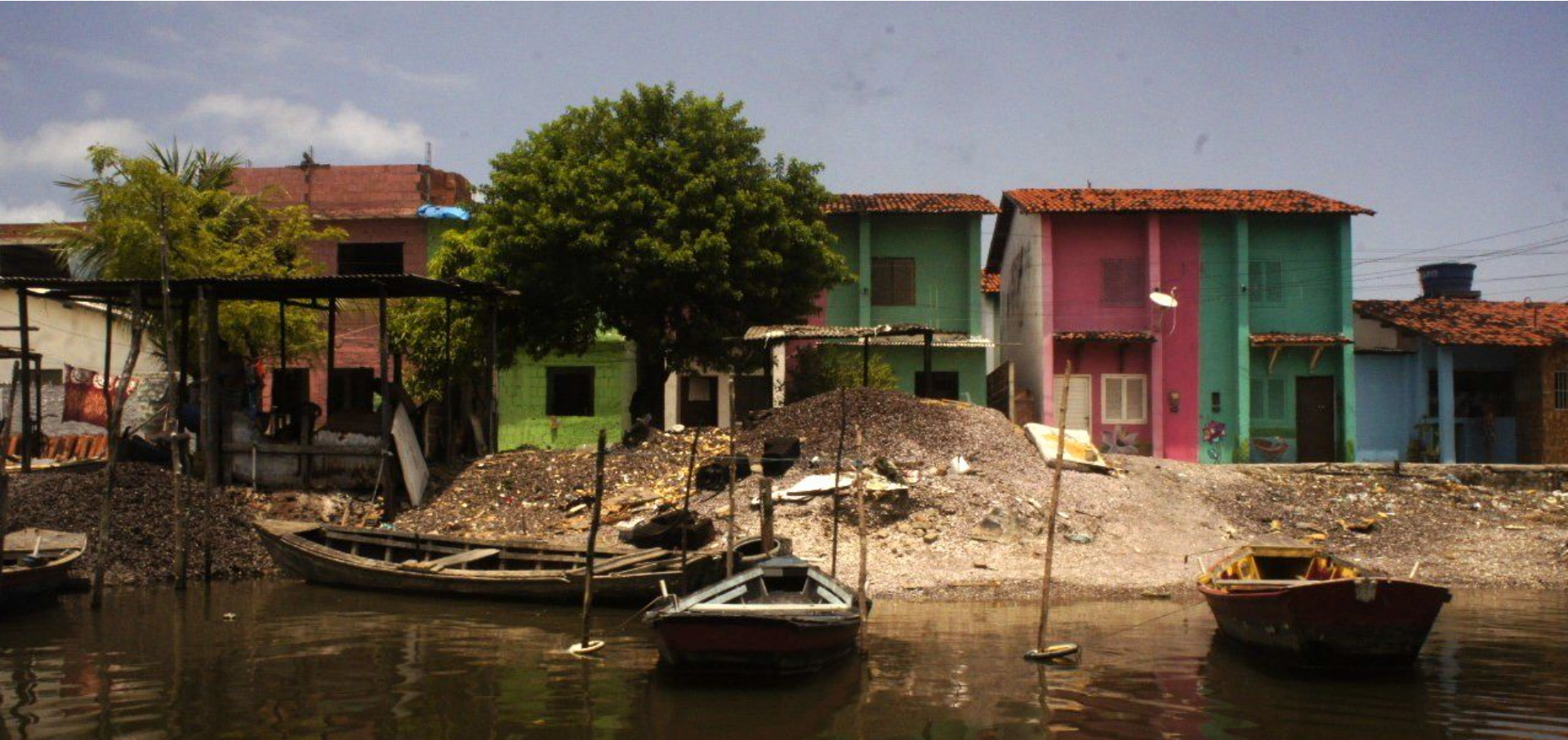
Houses in Ilha de Deus fishing community