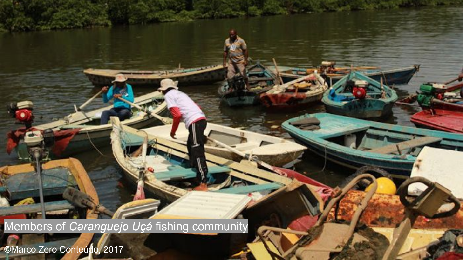
Members of Caranguejo Uçá fishing community